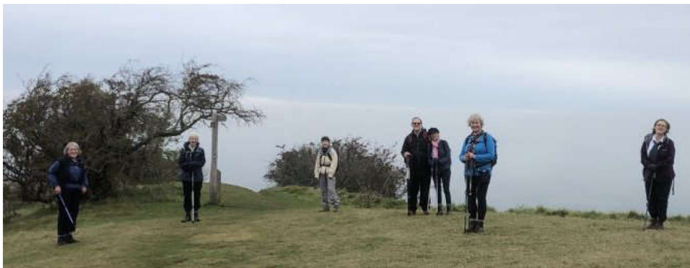
Cleeve Group Socially Distanced Walk in October

The Covid-19 Coronavirus has taken quite a toll on led walks. In July, at the end of the first lock down, Government had set a top limit of 30 people for walks when classed as a sporting activity. This suited Group walks mostly of about a dozen. With the virus still present though, many people were still wary of taking part. On the hand some were keen to meet up for a walk. October 14 th saw a new three tier (medium, high, very high) approach to Covid-19 restrictions. It wasn't enough and on 5 th November all outdoor activities were suspended as the virus began to spread again. There was a brief respite at the beginning of December before lock down again on 19 th December. The aim of walking again 5 th January passed too and now at the end of January only indoors Ramblers activities can take place.