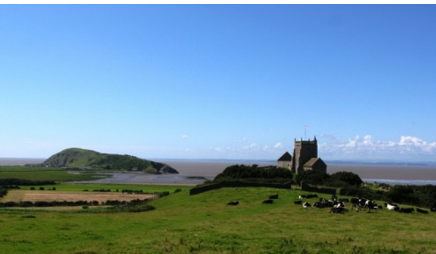
8 Uphill Church and beach with ice creams!