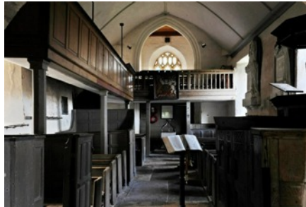
6 Rip van Winkle's church at Cameley with leaning walls, sloping floors, and wall paintings