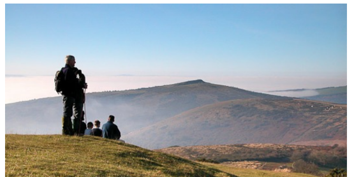
7 Crook Peak with the sea in the distance