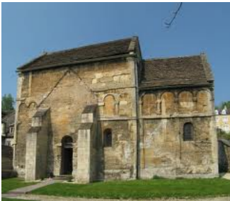
4 Historic Saxon church at Bradford on Avon and Medieval Tithe Barn (below)