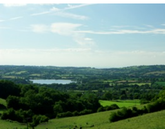
. . . Chew Valley Lake