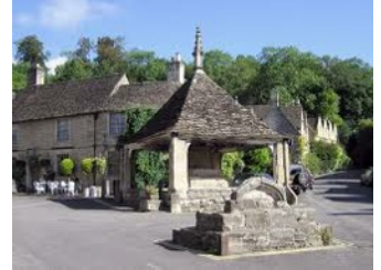
3 Castle Combe