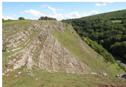
7 Mendips near Burrington Combe