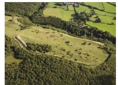
7 Dolebury Warren