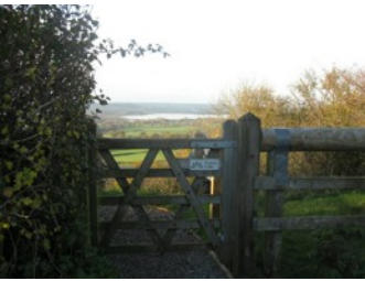
6 Prospect Stile with views over . . .