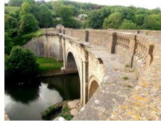
4 Dundas Aqueduct - K&A Canal over river Avon