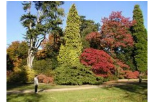
2 Westonbirt to Castle Combe