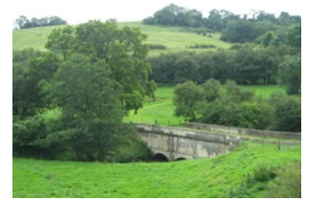
5 Midford aqueduct along the now quiet Cam Brook valley