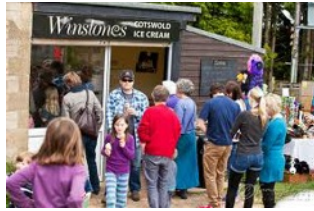
1 Winstones (first things first) to Westonbirt