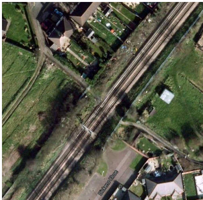
Aerial view of ZGL/143/1